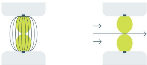
FIGURE 1. CONVENTIONAL BIPOLAR

With conventional bipolar (one pair of electrodes), electrical signals can escape through the weakness in the lesion.